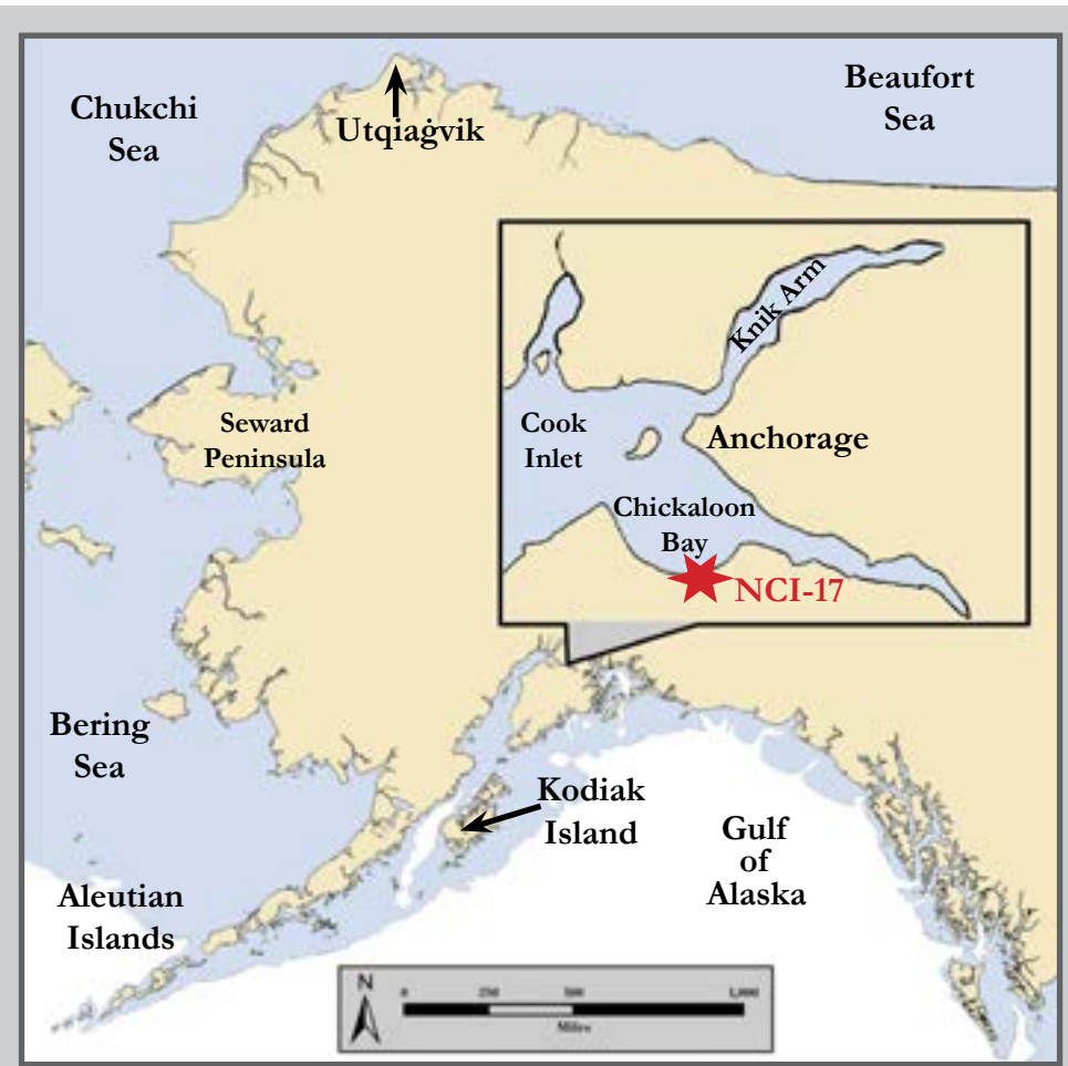
Location of NCI-17