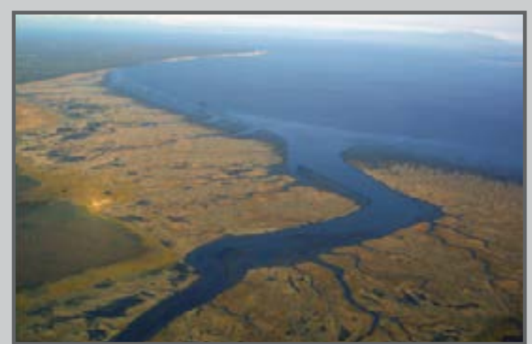
Chickaloon River mouth, View Northwest