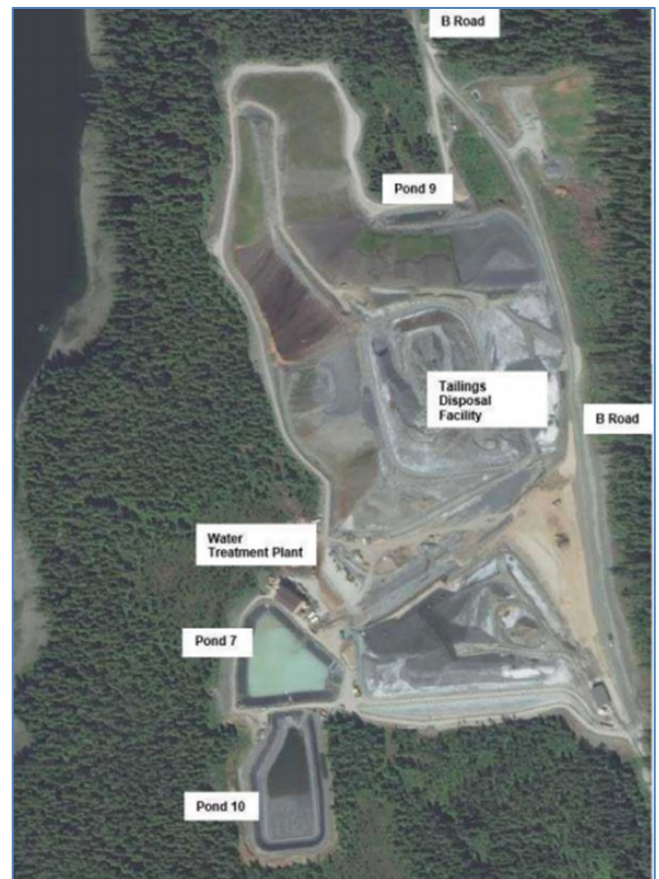
Figure 4. Tailings disposal facility

HGCMC will implement BMPs to reduce fugitive dust; monitor fugitive dust, water quality and aquatic biota; report results and evaluation of effectiveness; and modify BMPs as needed if monitoring and data analysis indicates the fugitive emissions are not decreasing and the chronic aquatic life criterion for dissolved lead continues to be exceeded. Examples of actions include: