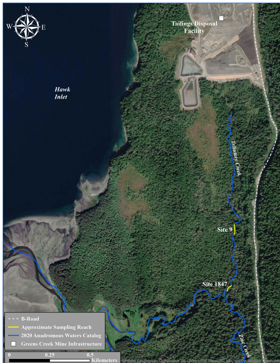
Figure 6. Water Quality Monitoring locations