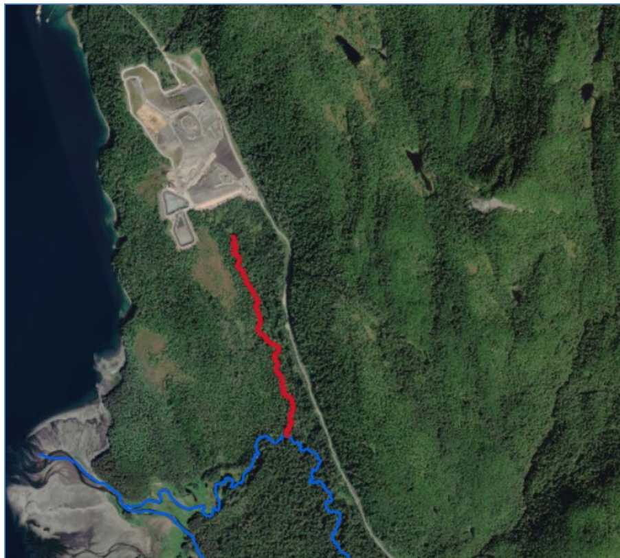
Figure 2. The location of impaired segment of Tributary Creek