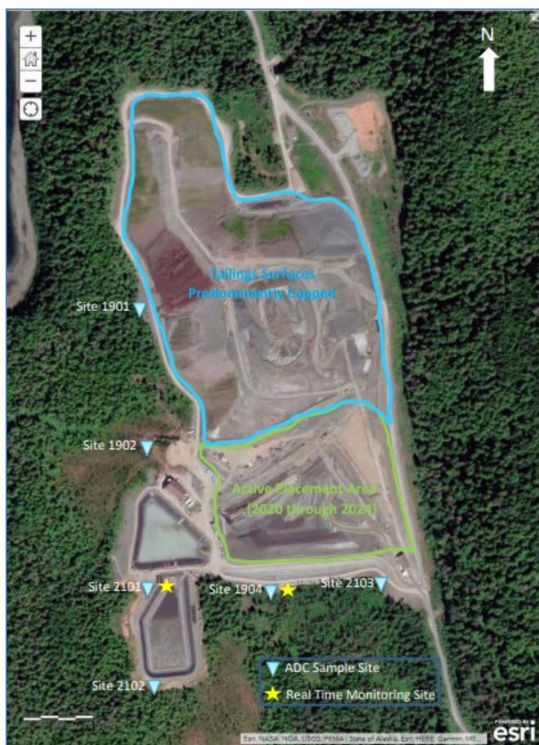
Figure 5. Dust monitoring, including Atmospheric Depositional Container (ADC) and real time monitoring locations

Aquatic biota monitoring is performed annually. The monitoring occurs at the middle and lower extent of the creek, and includes sampling periphyton, benthic macroinvertebrates, and juvenile fish. Specifically, the abundance and condition of juvenile fish, whole body concentrations of silver, cadmium, copper, mercury, lead, selenium, and zinc, periphyton biomass, estimated by chlorophyll a , and abundance and community composition of benthic macroinvertebrates.