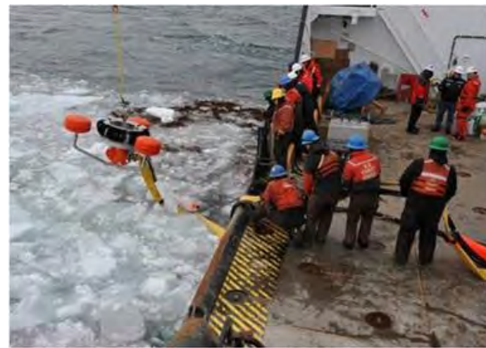
Oil in Ice