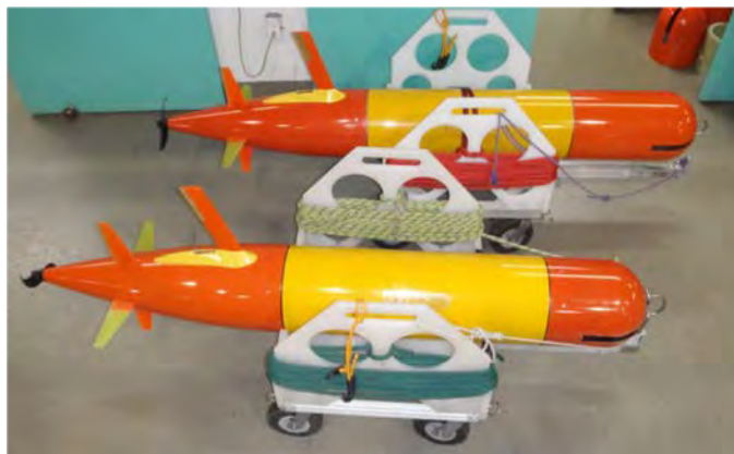
Long Range Autonomous Underwater Vehicle (LRAUV)