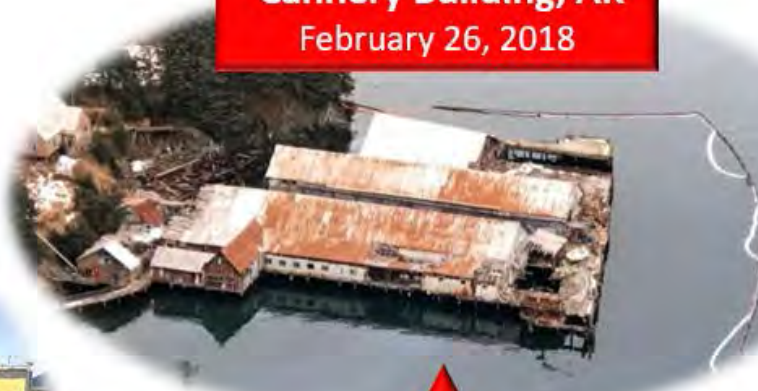
Cannery Building, AK February 26, 2018