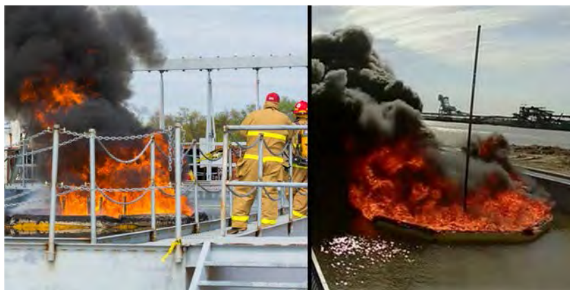
Improved In-Situ Burning (ISB) for Offshore Use