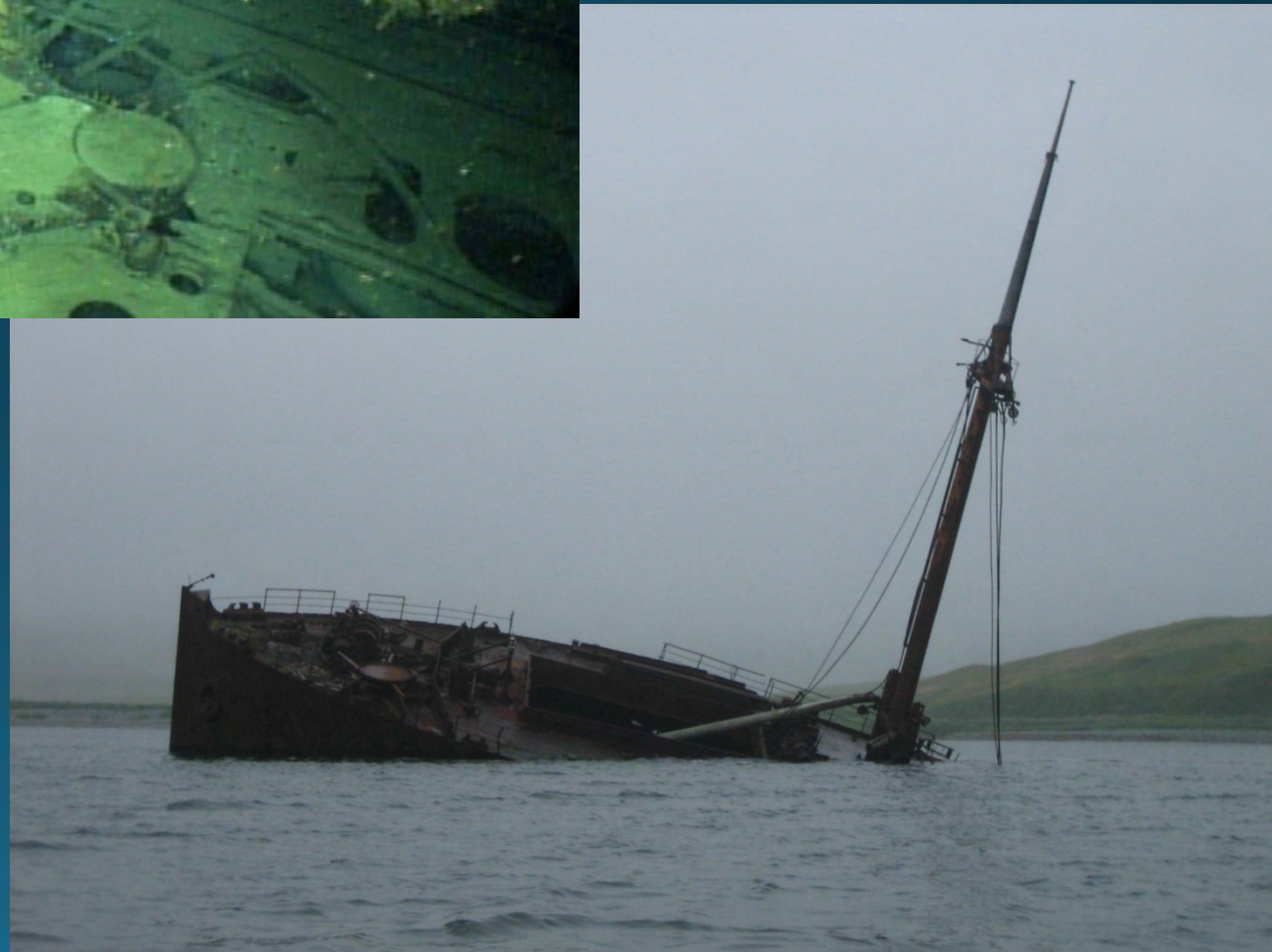
Japanese freighter Borneo Maru Kiska Island